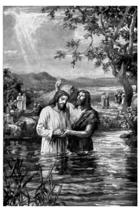
Now it came to pass, when all the people were baptized, that Jesus also being baptized and praying, heaven was opened; and the Holy Ghost descended in a bodily shape, as a dove upon him; and a voice came from heaven: Thou art my beloved Son; in thee I am well pleased.

These three men follow the leading of the light above, and with steadfast gaze obeying the indications of the guiding splendor, are led to the recognition of the Truth by the brilliance of Grace, for they supposed that a king's birth was notified in a human sense , and that it must be sought in a royal city. Yet He who had taken a slave's form, and had come not to judge, but to be judged, chose Bethlehem for