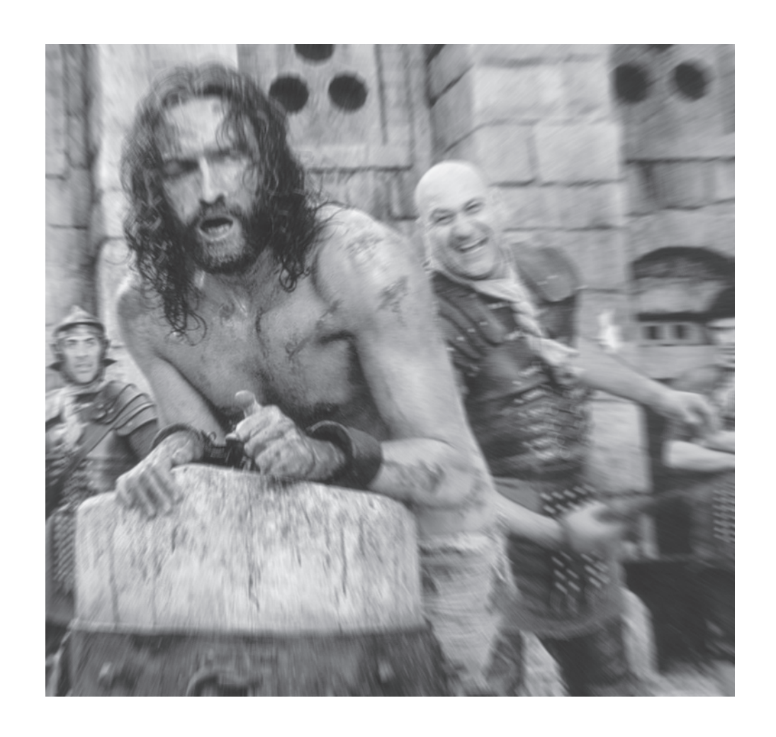
and washed their robes in the Blood of the Lamb

For the kingdom of heaven is theirs; who, despising the life of this world, attained the rewards of the kingdom