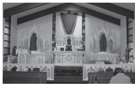
The altar at St. Anthony's on Palm Sunday, 2007, showing the beautifully restored main/side altars and rerados, as well as the brand-new altar rail.