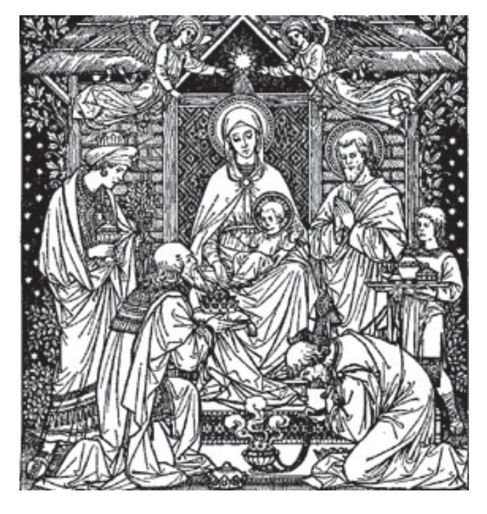
Let the heavens rejoice, and let the earth be glad before the face of the Lord, because He cometh